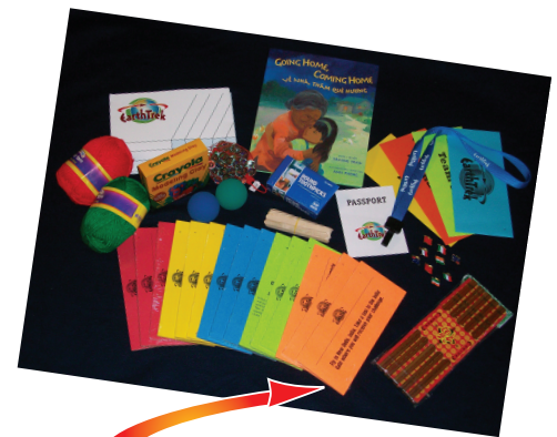
Example EarthTrek Materials