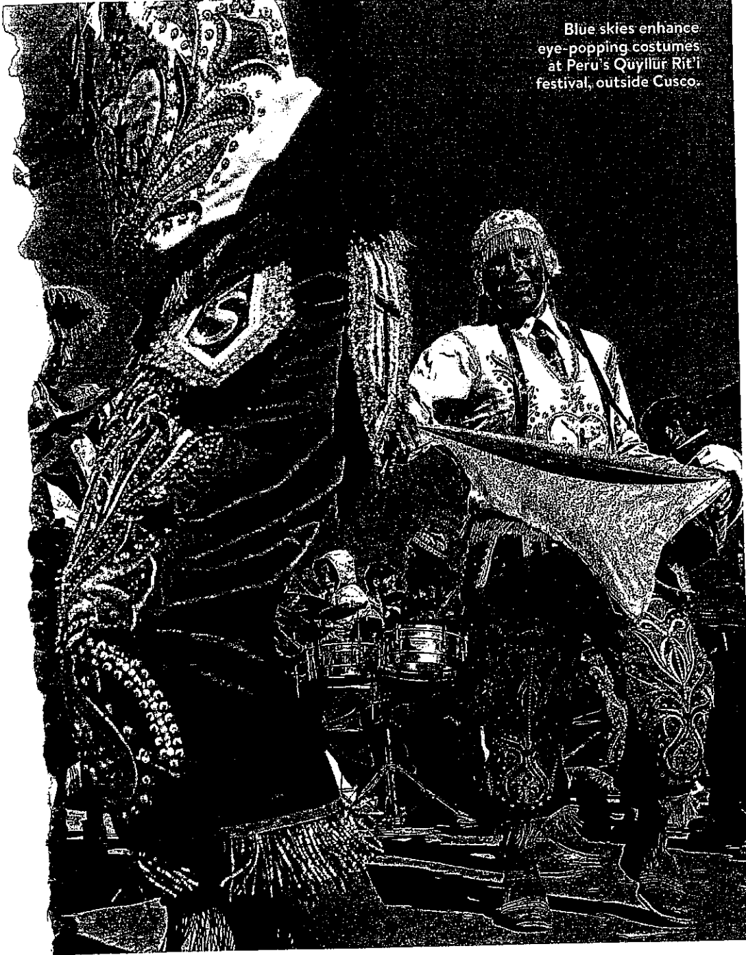
Blue skies enhance eye-popping costumes at Peru's Quyllur Rit'i festival, outside Cusco.