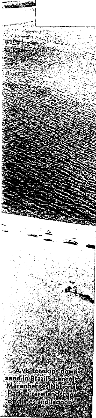
A visitor skips down sand in Brazil's Ilencois Maranhenses National Park, a rare landscape of dunes and lagoons.

expanses of Greenland's west coast, tracking wildlife—foxes, narwhals, polar bears—and uses such survival skills as building an igloo. Glamping on ice this isn't; most of your nights will be spent in basic canvas tents. WANT Expeditions: "Greenland Traditional Dogsled Expedition," 9 days; $6,749; www.wantexpeditions.com